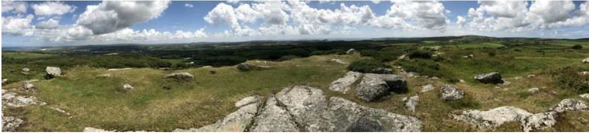
View across Trencrom