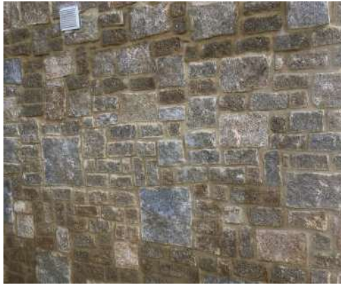
Out of local character layout of granite slips (too regular)