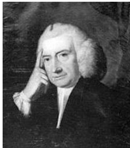
Sir William Borlase

Ludgvan has always been linked, like most other villages in West Cornwall, to the mining industry. The most prominent of the mines in the Parish was Wheal Fortune, which together with Wheal Bolton, Wheal Darlington and Wheal Virgin, were collectively known as the Marazion Mines, and are located in modern day Truthwall. Between 1815 and 1891 11,400 tons of copper and 3,000 tons of tin were mined here and the residual waste tip dominates Truthwall to this day. This mining activity probably accounted for a large part of the growth and expansion of the nearby settlements of Crowlas and Lower Quarter, shifting the focus of the main area of population from Churchtown to further down the hill and along the increasingly active trade and transport corridor now known as the A30.