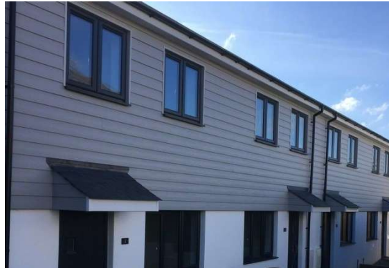
Use of non sustainable plastic cladding planks