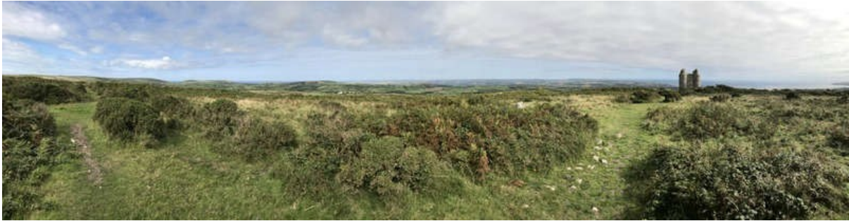
View across Castle-an-Dinas to Roger's Folly

The next recorded settlement was that of a very early religious community which arrived from Ireland in the 6 th . Century, led by a missionary called St Ludewon (or Ludowanus). The settlement is believed to have been contained within the boundary of the current churchyard in Churchtown, with evidence of 7 th Century grave markers. From this grew a Cornish Christian community and the first sections of the current St Paul's Church (originally dedicated to St Ludgvan and St Paul) were constructed in the 14 th century with further additions in the 15 th and 19 th Centuries.