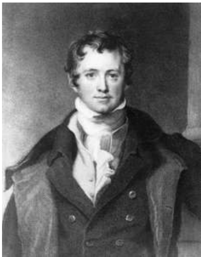
Sir Humphry Davy

Arguably the two most famous Cornishmen of the 18 th and 19 th Centuries were both linked to Ludgvan. First of these was Sir William Borlase (1696 – 1772) who was born in Pendeen but became Rector of St Paul's in 1722. He was a noted antiquarian, geologist and naturalist, best known for his publications "The Antiquities of Cornwall" and "The Natural History of Cornwall". Even this great scholar was, however, overshadowed by a more famous chemist and inventor, Sir Humphry Davy (1778 – 1829). Although born in Penzance he lived on the family farm at Varfell from the age of 9 and his parents are recorded as living (and indeed being buried) in Ludgvan.