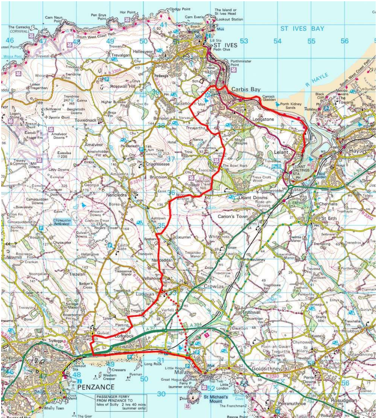
St Michael's Way