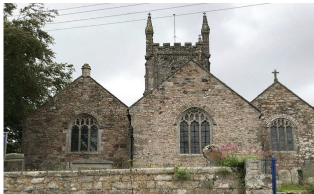
St Paul's Church, Ludgvan